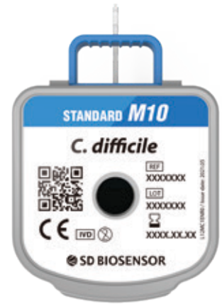
STANDARD™ M10 C. difficile