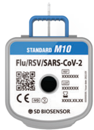
STANDARD™ M10 Flu/RSV/SARS-CoV-2