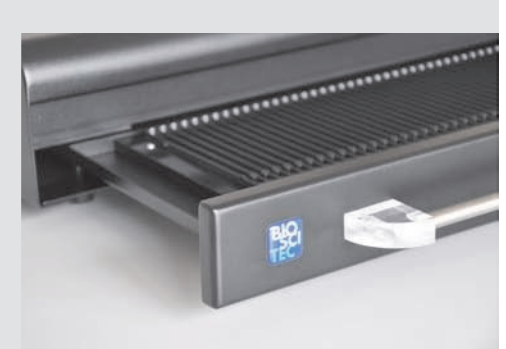
Strip images in the twinkling of an eye

Finally, your immunoblot teststrips can be reliably digitalized with two steps only.