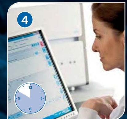
Amplify & Detect